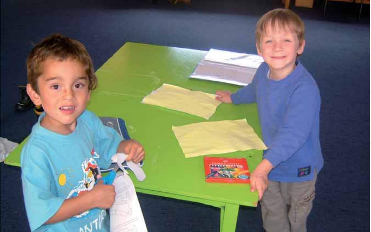
Finding our lost little lambs.

Award badges earned: 'Woolly Lamb' & the 'My God' puzzle piece