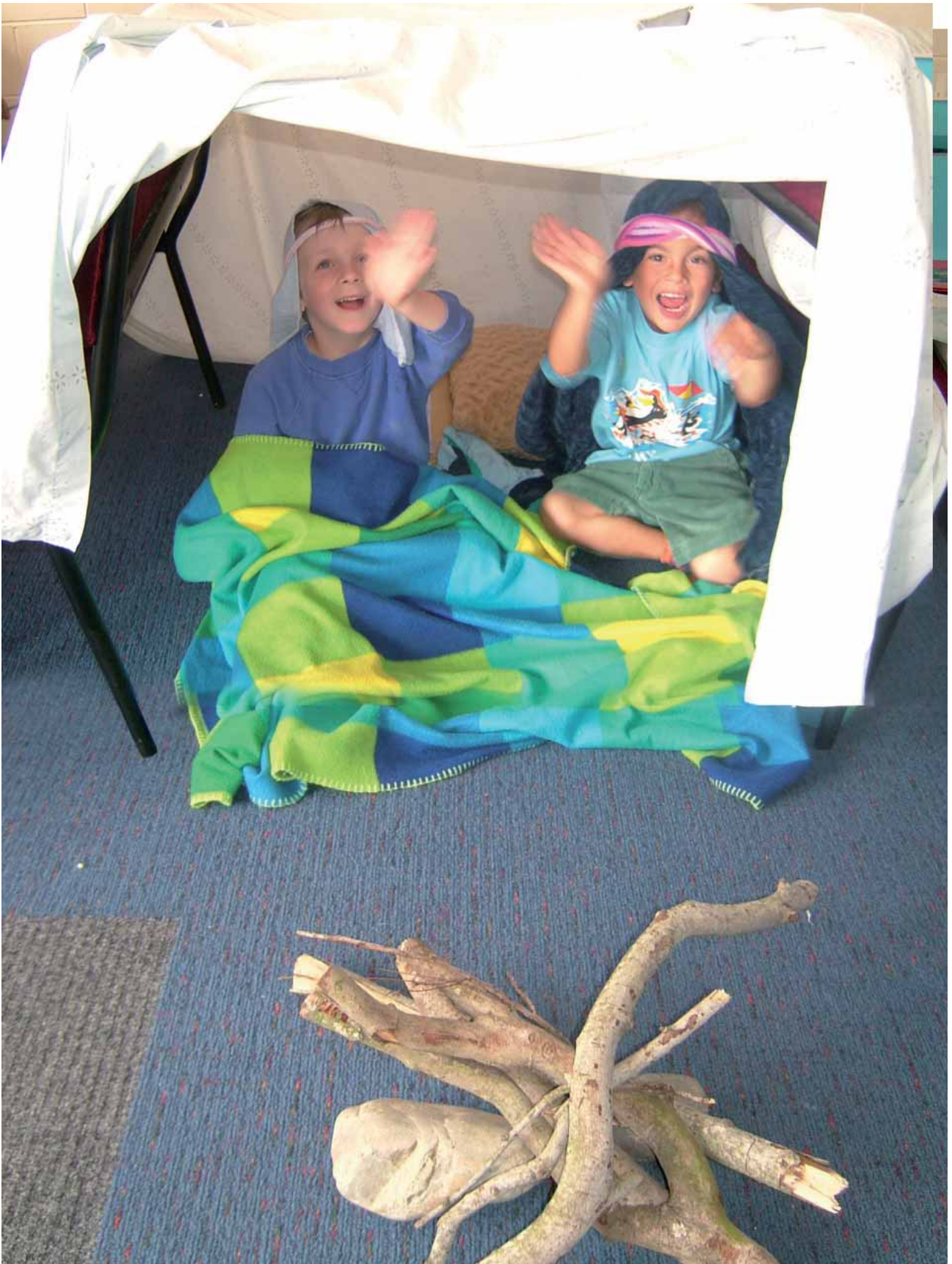
Shepherds camping out just like the olden days!