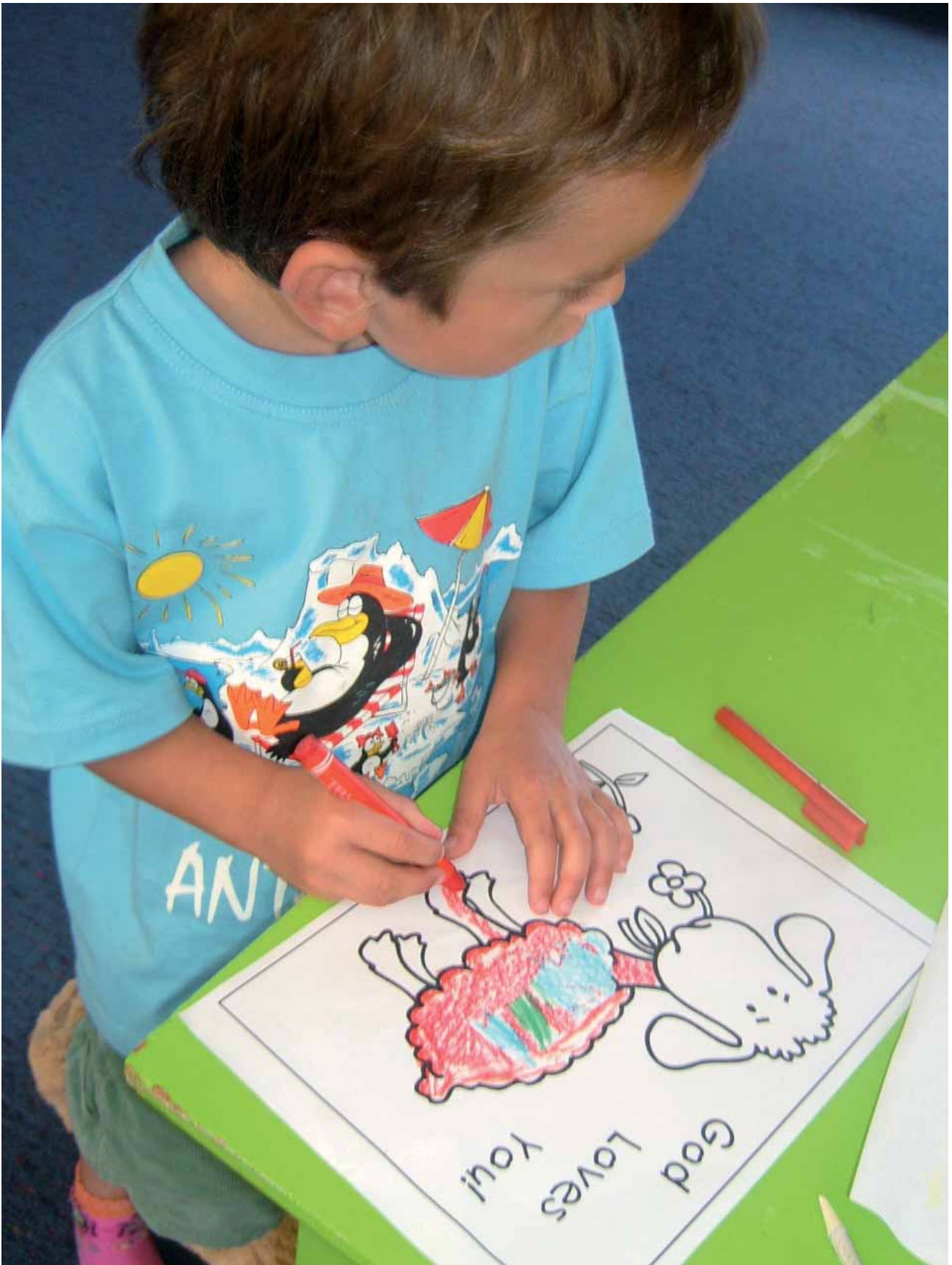
Enjoying colouring a message from his Creator.