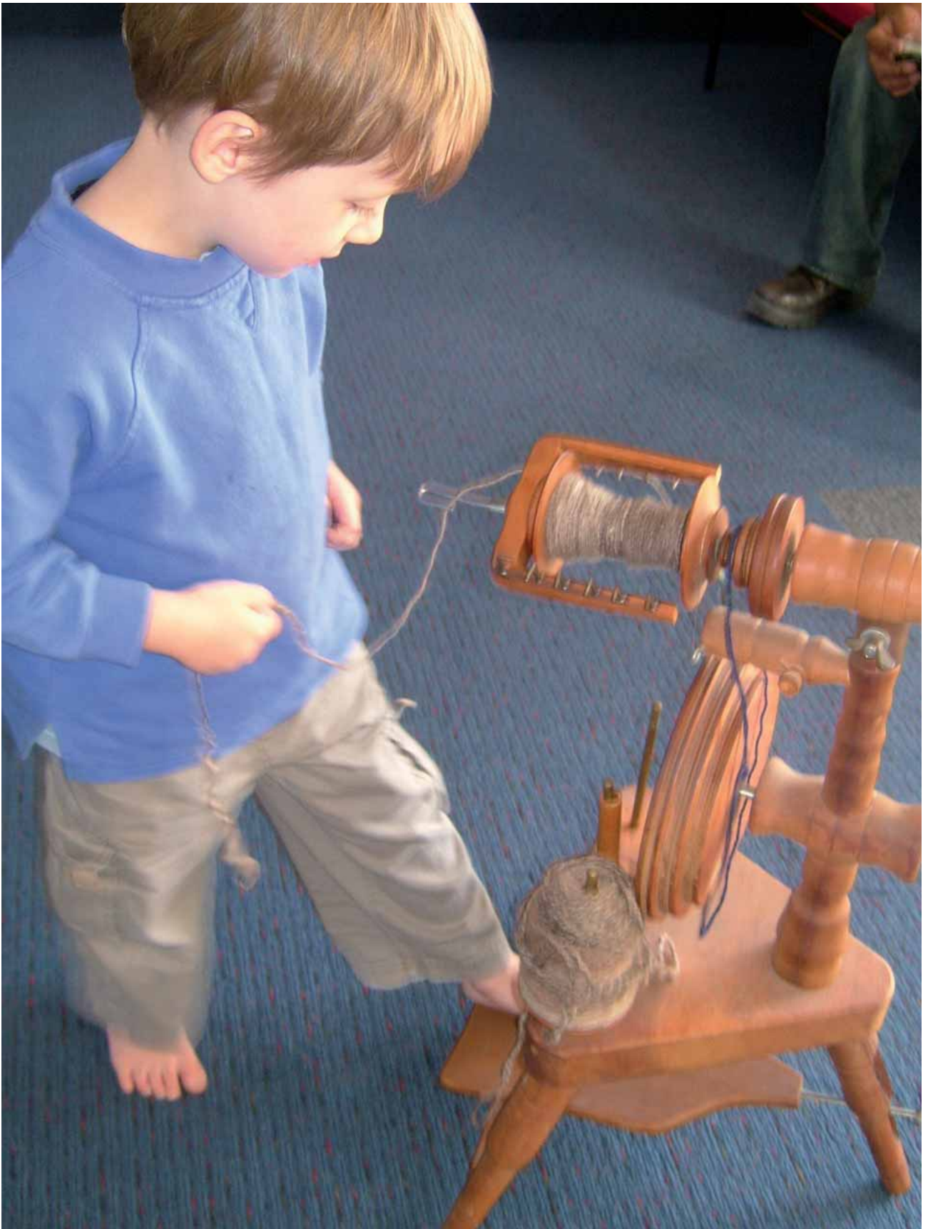
We tried our hand at spinning.